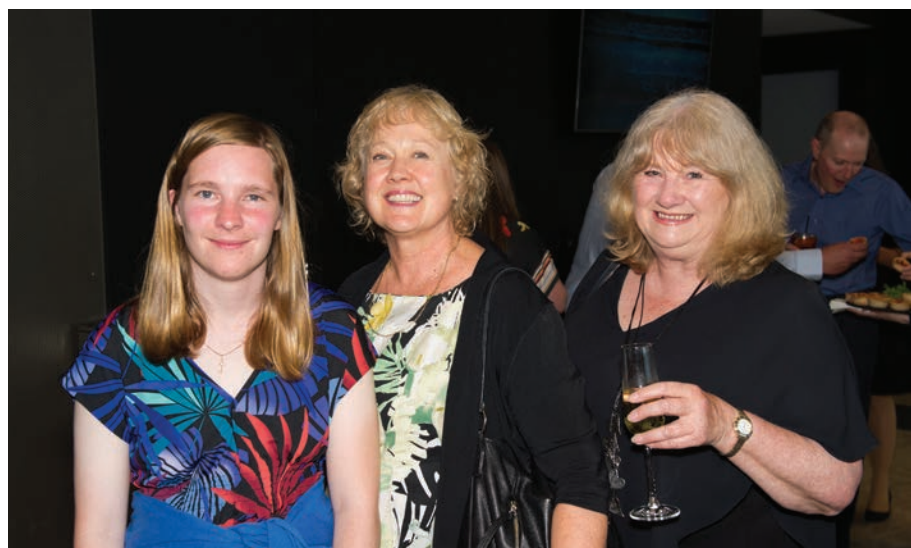
BCYF staff and vols attend Geelong Vol Awards