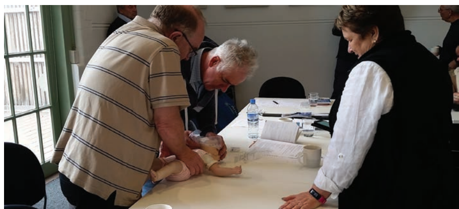
First Aid training.